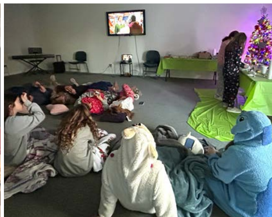
Cornerstone Students (left) enjoying the first day of Christmas Break together with a Christmas Movie Night! We watched Elf, had lots of snacks and hot cocoa, and made Christmas ornaments!