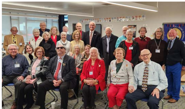
The Friendship class

The Friendship Class meets in the media center at East Point Academy each Sunday morning, 8:45-9:30 with the exception of Fourth Fellowship Sundays. During the Lenten season, class times will change and a second class will be offered. Keep watching communications and announcements for updates and come join us!