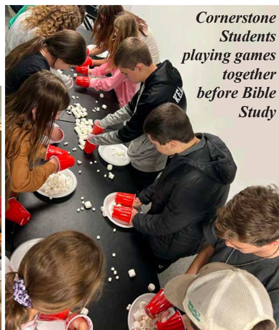
Cornerstone Students playing games together before Bible Study